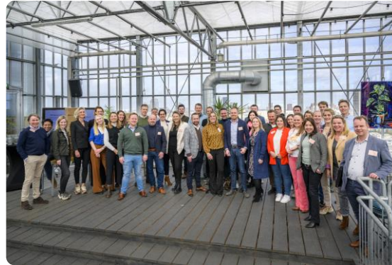
Agreement Healthy Food in Schools