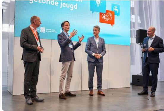
Call for health in Dutch programme for free school meals